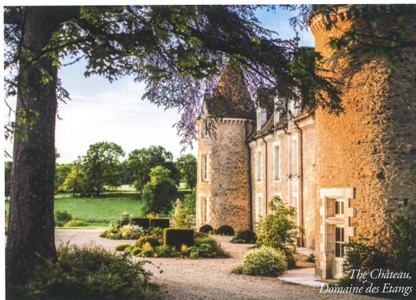
The Château, Domaine des Etangs

Postcard-pretty Oia, with its quaint white houses and azure-domed churches, has a stylish new retreat – and the recently opened Santo Maris is a calm refuge from the charming downtown chaos. It's a homage to Cretan simplicity, with sprawling, boho-luxe suites tricked out in shades of milk and honey; infinity pools blending seamlessly into the blue beyond and shady verandahs for escaping the blazing sun (or watching the sky turn pink at sunset – creating the ultimate Instagram shot). Life is simple; the food fresh; days pass slowly – leaving ample time to enjoy the spa. A cool, subterranean space, it recalls Cycladic cave houses, with treatments that channel the volcanic energy of the island: think deep cleansing facials with black lava and hot stone rituals using naturally sourced basalt and massages. (For those who can't summon the energy to leave the pool, an orange-infused olive oil massage in the outdoor gazebo brings newfound zest.) Double, from £380 (santomaris.gr).