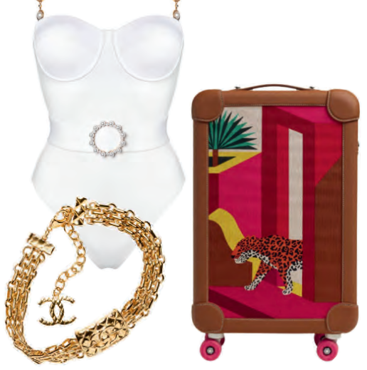
Jacket, £3,850, and trousers, £1,200, GIORGIO ARMANI . Bag, £2,750, DIOR . Sandals, £920, LOUIS VUITTON . Swimsuit, £295, NADINE MERABI . Suitcase, £8,600, HERMÈS . Necklace, £1,365, CHANEL