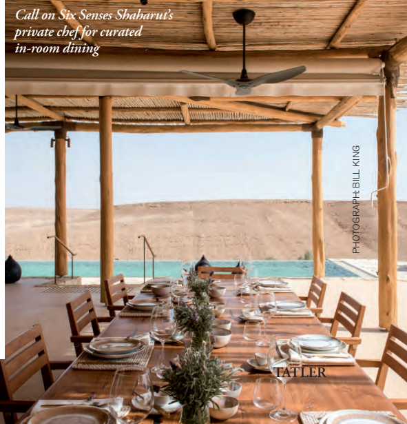
Call on Six Senses Shabarut's private chef for curated in-room dining